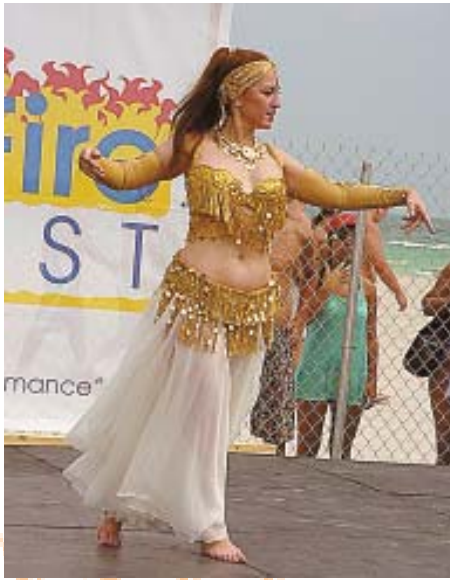
Now THAT'S a great workout!