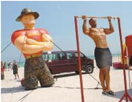
No fitness event would be complete without a US Marine workout!