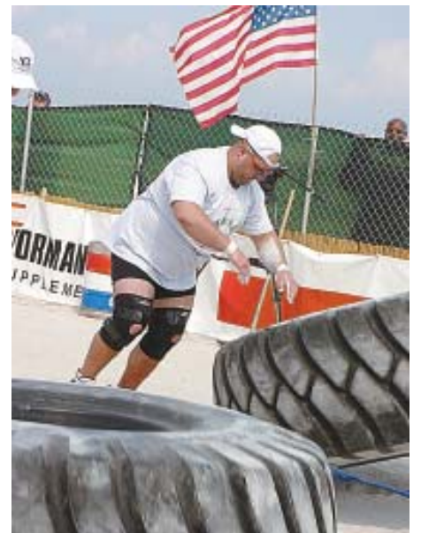
Viking Strong Man Challenge..ARRRGH!!